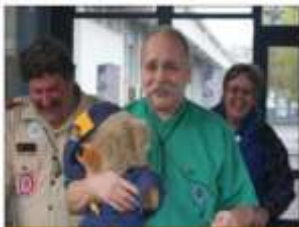
A little prankster action at Pow Wow

Mark your calendars with next year's University of Scouting/Pow Wow date, 23 January 2010. Theme is to be determined soon.