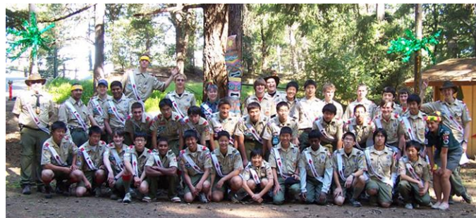
Polaris Camporee OA and Venturing staff

Thanks to the Order of the Arrow who, along with some Venturers, combined to put on another successful Polaris District Camporee. Camporee was held 18-19 April at Camp Chesebrough.