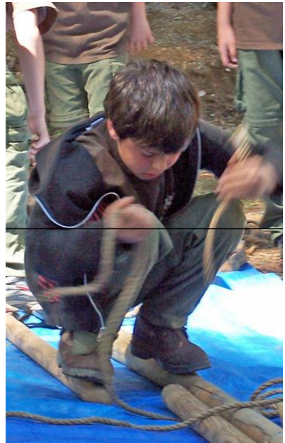
Scouts find creative river crossing methods at camporee

For more information, contact Kurt Takara: ktakara@scualum.com